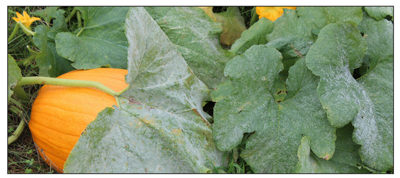
FIGURE 1. POWDERY MILDEW ON PUMPKIN FOLIAGE.

Powdery mildew is easily identified by the presence of white, tan, or gray powdery fungal growth (mycelium and spores) that is present primarily on surfaces of infected plant parts. Immature plant parts are often most susceptible. Affected leaves (FIGURES 1 to 3),