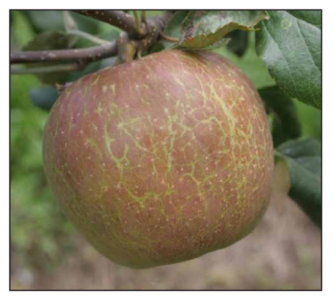
FIGURE 7 . EARLY INFECTIONS OF APPLE FRUIT RESULT IN NET-LIKE RUSSETTING AS FRUIT MATURES.

severely infected leaves drop prematurely. Fruit may be misshapen, fail to color properly, become russetted (FIGURE 7), or split open. Fruit of many vegetables do not become infected, but powdery mildews can still reduce yield and/or quality.